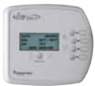
Indoor Control Panel for 4 or 8 Function Control