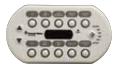
10-function Spa-side Remote